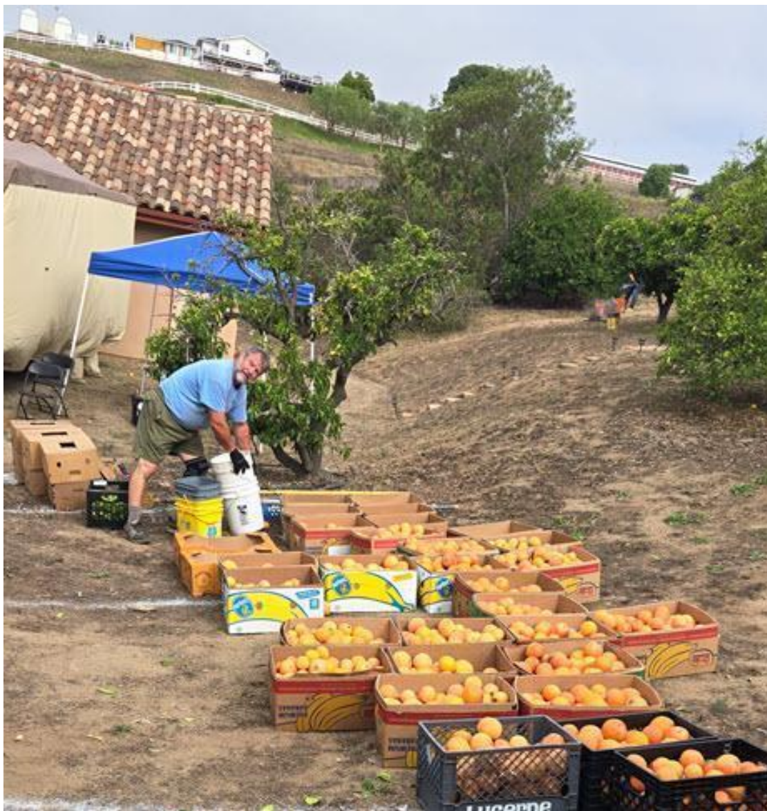
Fresh produce sorted and prepared for delivery to local hunger-relief partners.

Every pound of produce rescued represents both food recovered and waste avoided. By diverting edible produce from landfills, Senior Gleaners helps reduce methane-producing food waste while promoting healthier communities and sustainable local food systems.