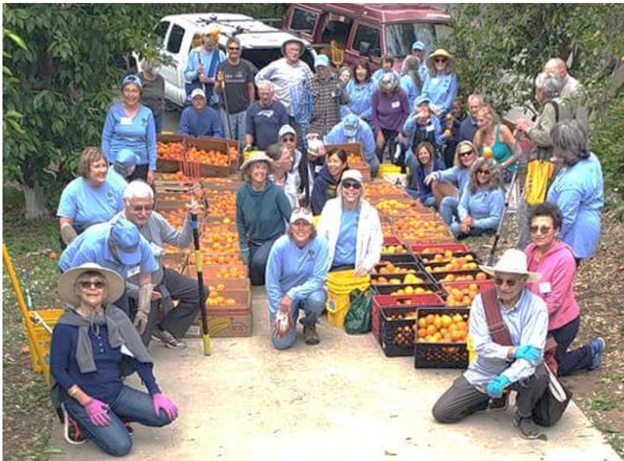
Senior Gleaners volunteers after a successful community glean.