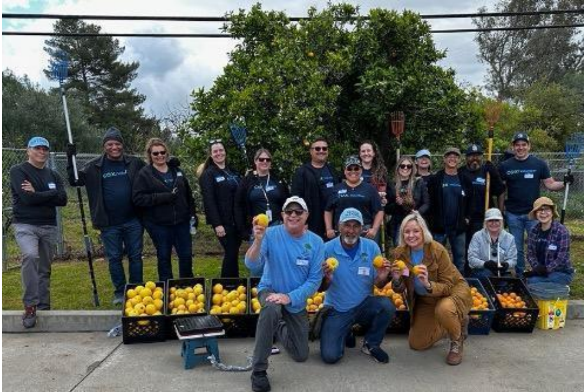
Corporate and community volunteers participating in Senior Gleaners' Pick for a Purpose program.

The “Pick for a Purpose” initiative continued creating opportunities for corporations and community groups to participate directly in meaningful volunteer experiences while supporting local food recovery efforts.