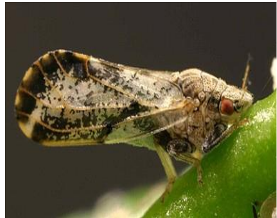
The Asian citrus psyllid is spreading a disease that is killing citrus trees worldwide. You can help slow the spread in San Diego County.

Due to concern about the spread of the disease, the Senior Gleaners Board in November voted to confirm that Senior Gleaners will not pick citrus in any HLB quarantine areas.