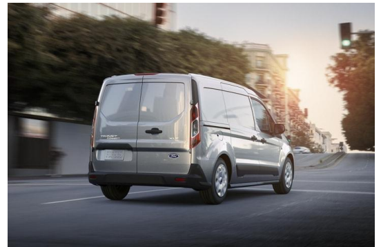
Help fund the purchase of a van for a 30th birthday present in 2024.